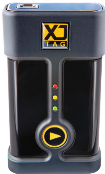
Available in black and yellow.*